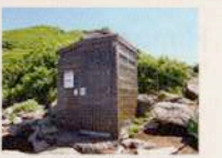
Portable Toilet Booths