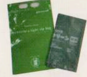
Portable toilet -1set- 500yen (Includes 1portable toilet and 1case)

Purchase portable toilets before going up the mountain (available at accommodation facilities and tourist information centers). Portable toilets can be used at portable toilet booths on the trail. The fast-absorbing coagulation sheet hardens water, has excellent anti-bacterial and anti-viral properties, and absorbs sound and odors during use. Use them to protect the natural environment.